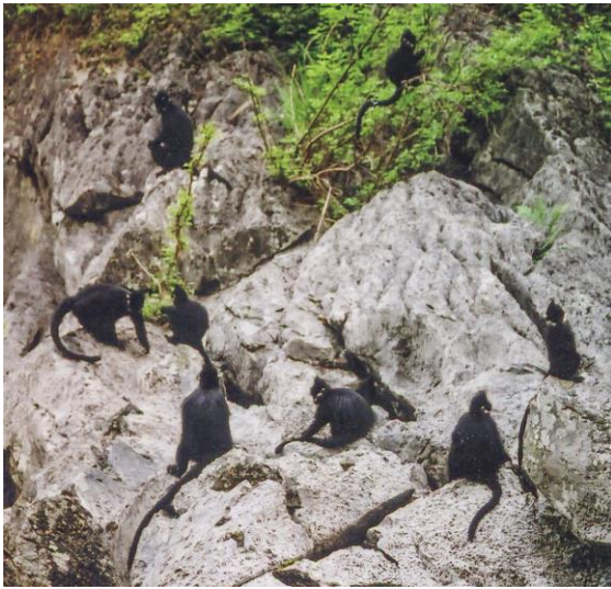
Francois' langur ( Trachypithecus francoisi ) in their limestone (karst) habitat