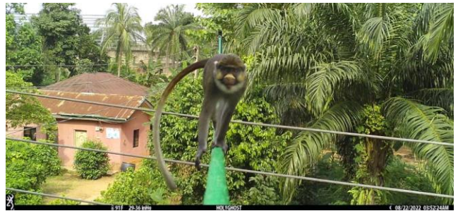
Camera-trap photo of a Sclater’s monkey crossing an artificial canopy bridge over a road in Akpugoeze, Nigeria.

Given our findings, we are investigating a potential regional program aimed at the conservation of sacred species (not only primates) and forests across southeastern Nigeria. We have sought collaboration with others working in this region, such as the Nigerian Conservation Foundation, which has a program on