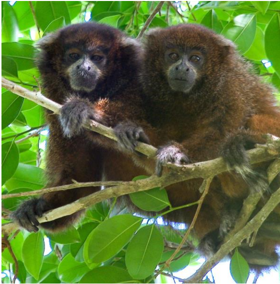
Male and female Beni titi monkeys ( Callicebus modestus ). This species has been documented to be endangered.