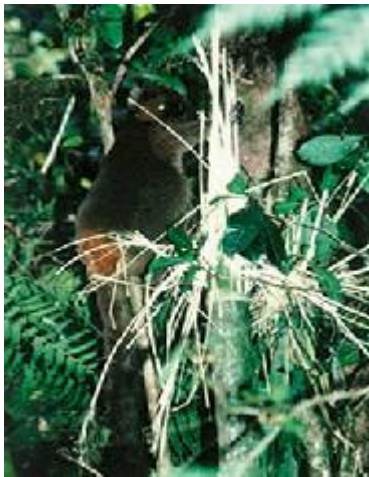
Greater bamboo lemur eating giant bamboo

In 1992 it was very difficult to find the extremely rare bamboo lemurs in Ranamafana National Park but by 1998 guides could take you to whichever species you wanted to observe. This would never have happened without the work of Chia Tan and other dedicated researchers and field assistants that habituated these primates to humans. They followed these lemurs from sunup to sunset, upslope and down, often through wet forest. Chia's three-year study of the three bamboo lemurs in the Park has shown how three closely related species of different sizes share the same habitat. Though they all eat bamboo, they each concentrate on different bamboo species.