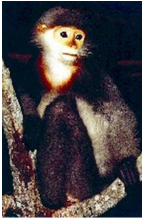
Grey-shanked Douc Pygathrix cinerea